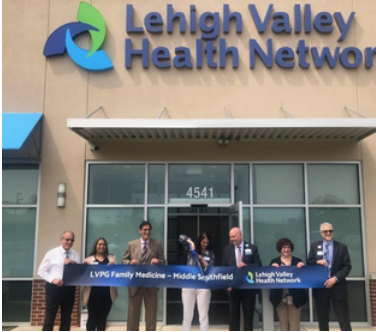
The ribbon cutting for the brand new LVHN facility in Middle Smithfield Township.

On July 5, 2023, LVPF Family Medicine - Middle Smithfield officially opened its doors at 4541 Milford Rd., bringing a long-time dream of the Township to fruition: closer access to great medical care facilities right in town.