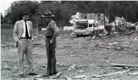
A state official and state police officer on the scene after the explosion in Marshalls Creek in 1964.

Stay tuned for an expanded page on the township website, but in the meantime, please visit the Middle Smithfield Township Building at 147 Municipal Drive.