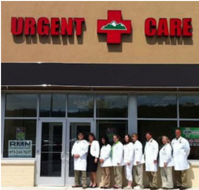
Pocono Urgent Care at the Crossings of Marshalls Creek Complex (Price Chopper complex)

With the final piece in place, the Township looks forward to expanding upon the great services now available to residents.