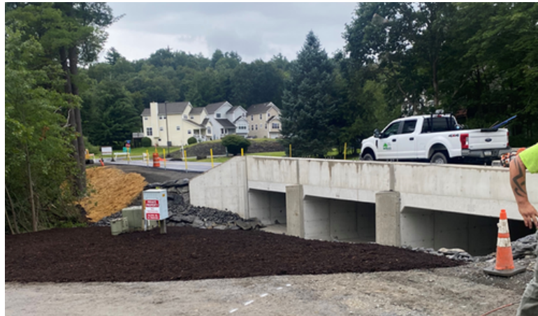
The Middle Smithfield Township Public Works Department working on replacing the bridge on Big Ridge Dr.