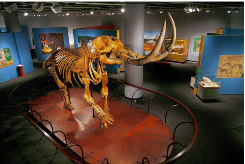
The Marshalls Creek Mastodon on display at State Museum of Pennsylvania in Harrisburg.