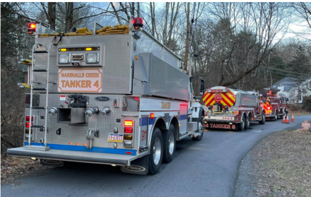
*average homeowner in Middle Smithfield pays a township property tax of $300 or less per year