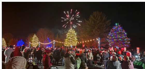
The Firework Spectacular at the MST tree lighting following Santa's arrival.

THANK YOU TO OUR PARKS SPONSORS WHO HELP MAKE THESE EVENTS POSSIBLE!