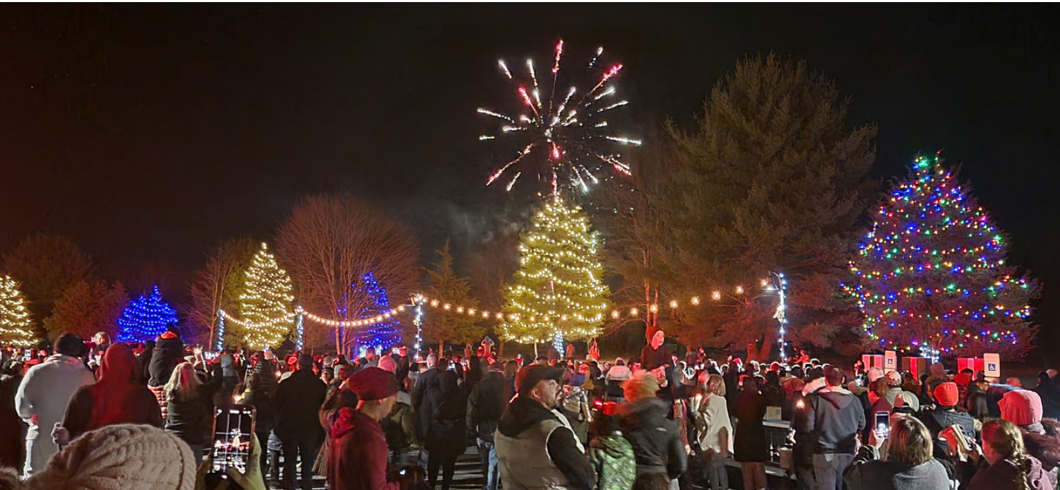
The Firework Spectacular at the MST tree lighting following Santa's arrival.