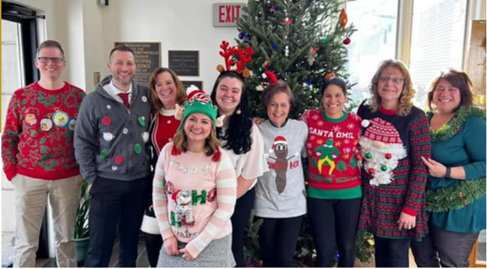
Township staff (& their ugly sweaters) wish you a very happy holiday season!