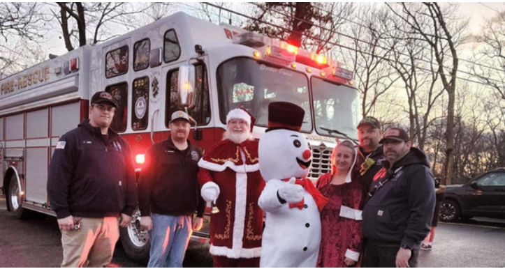
Bushkill Volunteer Fire Company poses with Santa, Mrs. Claus and Frosty!

For any further questions regarding toy/gift donations, please contact us at 570-588-6033. Happy Holidays!