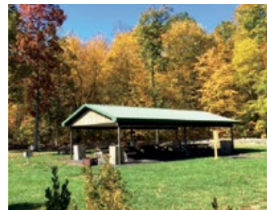
The Pavillion at Resica Park,

Spring is here! That means getting outside, seeing family, and having picnics. Need a great outdoor venue to host your spring or summer party? Middle Smithfield Township has two great pavilions at Echo Lake Park and Resica Park that are available to rent for your event.