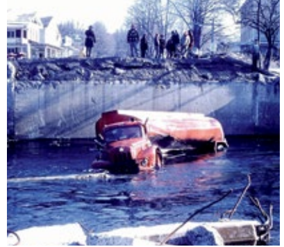
Taken on Sunday, August 21, 1955. Route 209 bridge was located over the Bushkill Creek. It is rumored the driver was killed.

Between those storms, 13" of rainfall were dumped in Stroudsburg and 20"-22" in Mount Pocono. Throughout the summer of '55 the Poconos area suffered from a drought and while this rain was needed initially, it soon turned destructive and deadly.