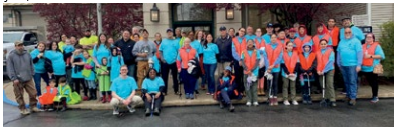
Thank you to our 2024 Spring 1000 Feet of Street Volunteers!

This year's first 1000 Feet of Street Litter Pick Up was held on Saturday April 20. During this event there were 70 volunteers who cleaned over 15 miles of road. the next event will be Saturday September 28, but volunteers are welcome to help clean up any time. Any day that works for you, works for us!