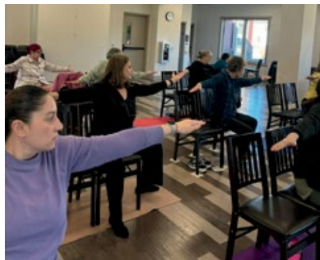
Chair Yoga participants at the Community and Cultural Center.

Chair yoga is a great form of exercise for older adults and people with certain health conditions, such as arthritis, to exercise without putting pressure on joints. It may also reduce the fear of falling, and help people who are not used to exercise to begin improving their strength and balance.