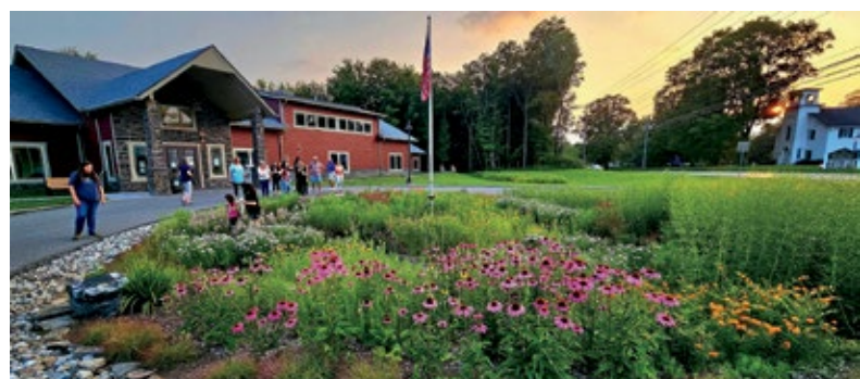
Top Photo: Volunteers from Penn State Extension Master Gardeners tend to the rain garden at the Community and Cultural Center. They hand planted over 2,500 plants, weeded, and watered.