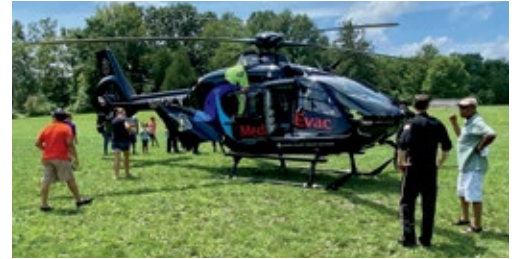
MedEvac at the 2023 Community Day.

The Middle Smithfield Township Parks & Recreation Committee will host the 4th Annual Community Day on Saturday July 13 from noon to 3pm, at Echo Lake Park in East Stroudsburg, PA. The rain date is Sunday July 14.