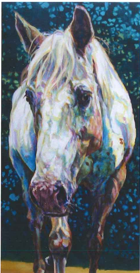
Patricia A Griffin - Cheeky Gina 48 x 72 | Oil on Canvas

PHOTO EXHIBIT DETAILS • FRIDAY APRIL 8TH, 6:30-8:30PM • WHISPERING PINES BANQUET HALL FREE; LIVE MUSIC, FOOD, WINE TASTING • MIDDLESMITHFIELDTOWNSHIP.COM