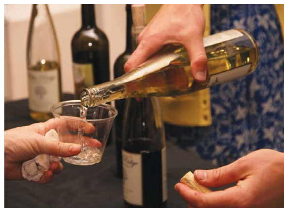
Blue Ridge Winery paired every dish with one of their wines.

124 Golf Dr #1 | East Stroudsburg, PA 18302 | 800-259-8665 fernwoodresortpoconos.com Facebook: Wintergreens Patio Grill