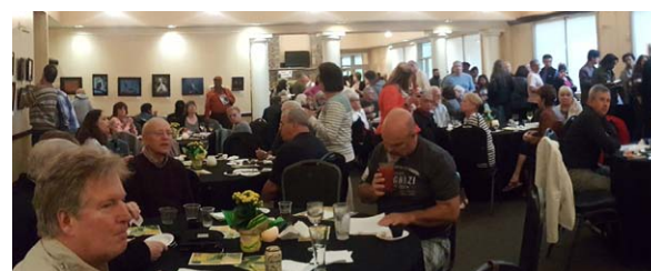
Restaurant week kickoff