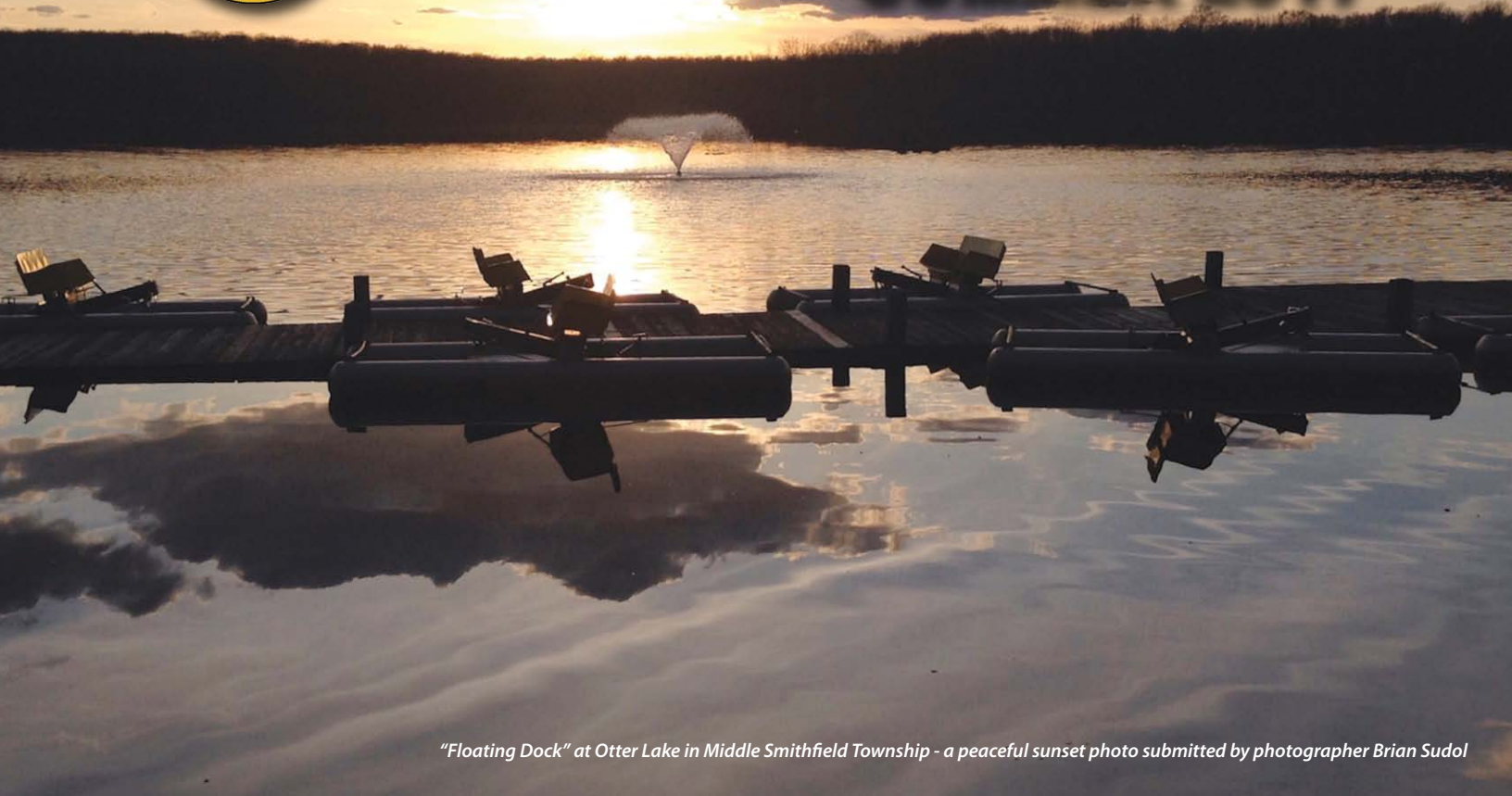
"Floating Dock" at Otter Lake in Middle Smithfield Township - a peaceful sunset photo