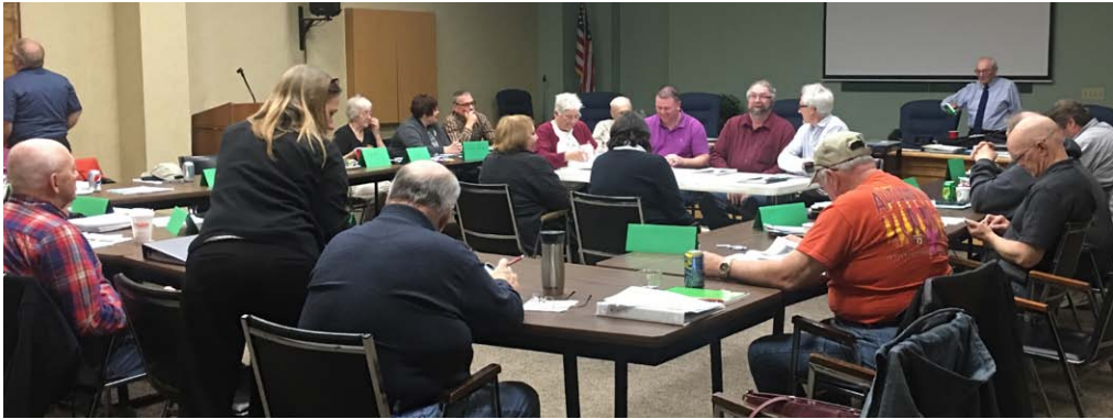
Middle Smithfield Township recently organized and hosted a PMPEI course in Zoning Administration. Twenty-six people from local municipalities, including four of our own Zoning Hearing Board members, attended to make this course a success.