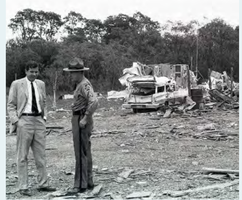
A state official and state police officer on the scene after the explosion in Marshalls Creek in 1964.

The Firemen arrived just after 4:00am and immediately started to fight the burning rubber. Seconds later, the trailer exploded destroying the Regina Hotel, nearby Pocono Reptile farm and severely damaging Middle Smithfield Elementary. The explosion killed three volunteer firemen, three innocent