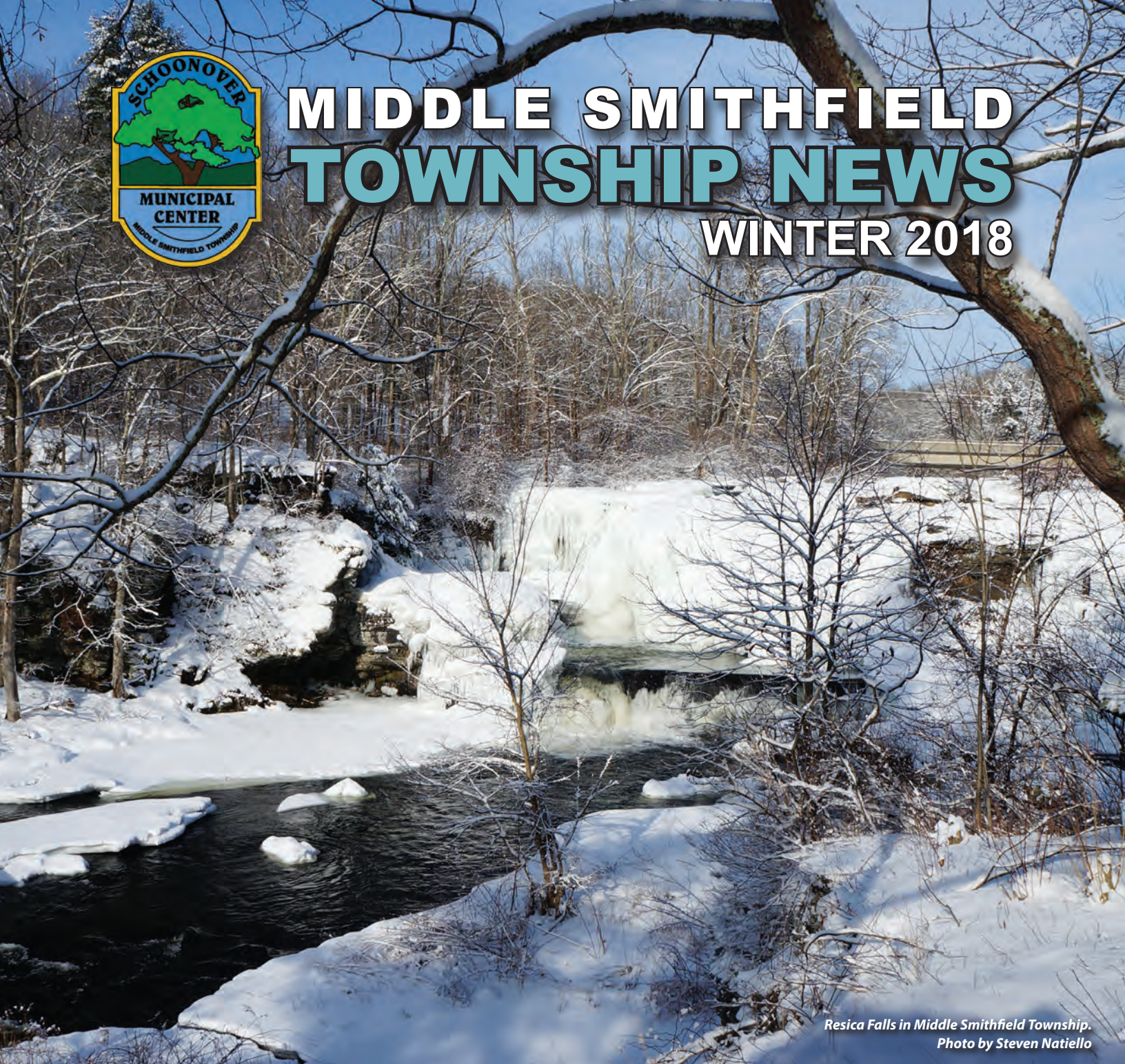
Resica Falls in Middle Smithfield Township.