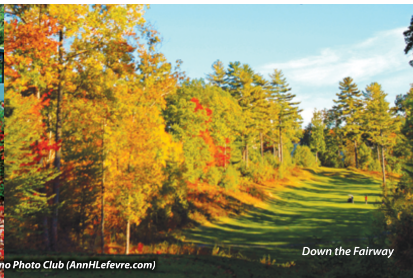
Down the Fairway