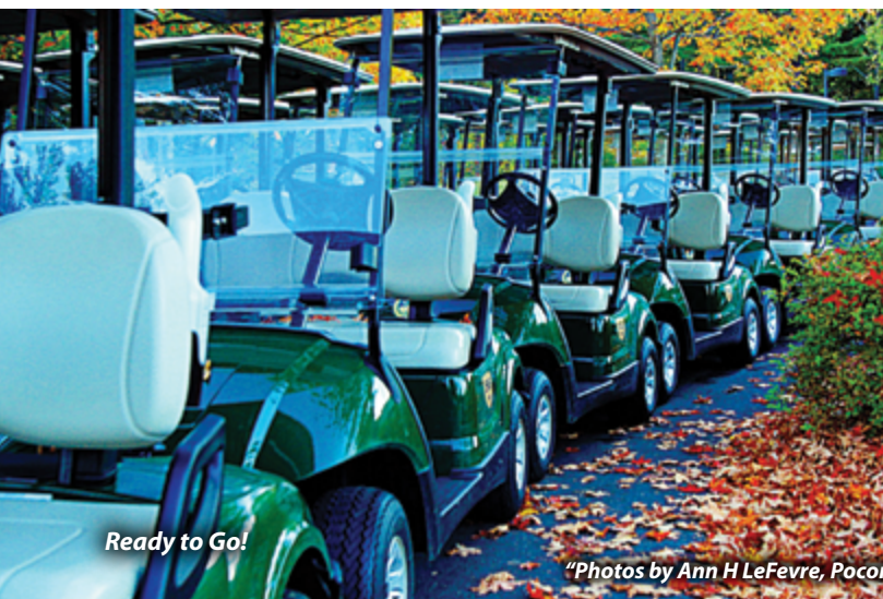
Ready to Go!

The township looks forward to helping non-profit organizations raise money. Contact the pro shop to find out how you can raise even more money by having your outing at Country Club of the Poconos.