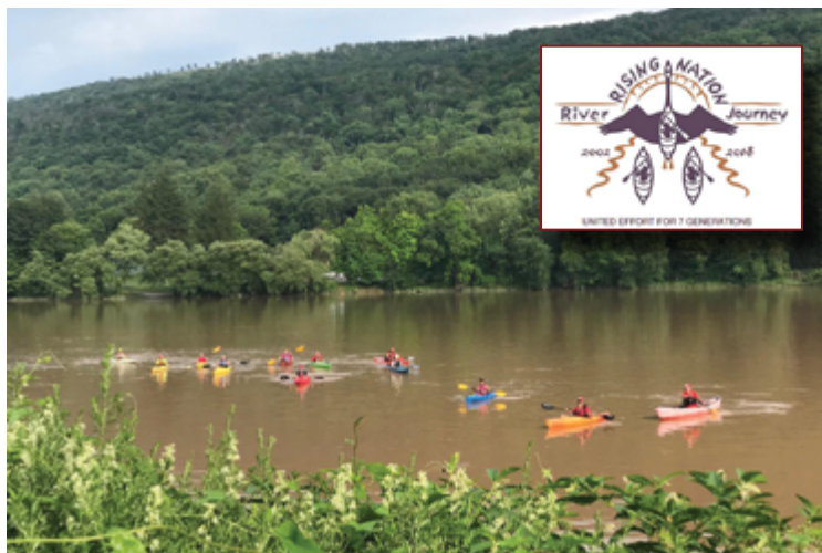
The Lenape Nation paddling down the Delaware