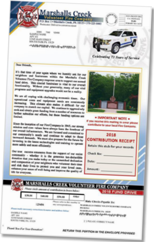
Our real donation letter looks like this.

Primarily it is a program to provide tax credits to start-up companies. The tax credit is applied against the tax liability of a KIZ company (state taxes) and because most start up KIZ companies do make enough in the initial years to have the liability , the tax credit can be sold ,and the proceeds funneled back into the company. The company has to be 0-8 years old in a specific industry sectors: Information Technology, Homeland Security, Biotechnology/Life Sciences, Healthcare, Advanced Manufacturing, and Financial Services.