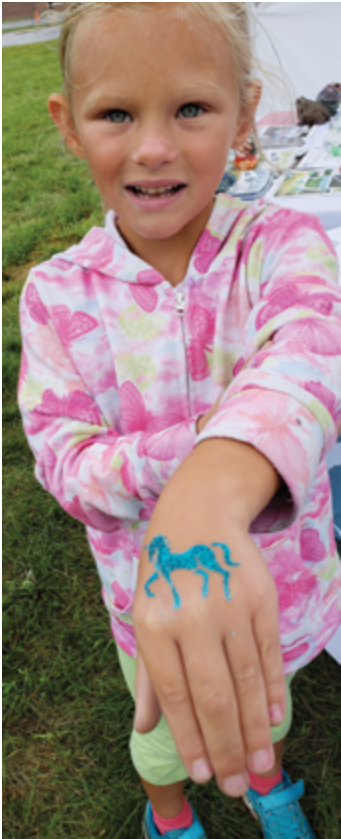
A young resident gets a tattoo at Community Day.