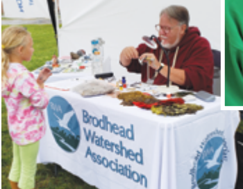
The Broadhead Watershed Association at Community Day, with information on the importance of our pristine Pocono Water.