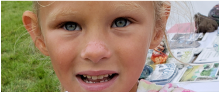
MTS Community Day, a success despite the weather.