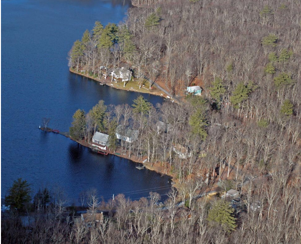
Lakeside Development/Recreation and Tourism