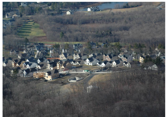
Growth and Development